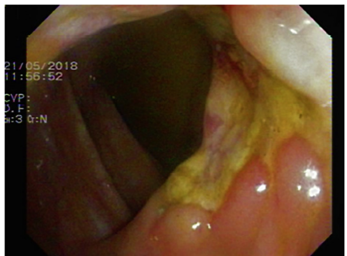
Fig. 2. Hepatic flexure lesion.