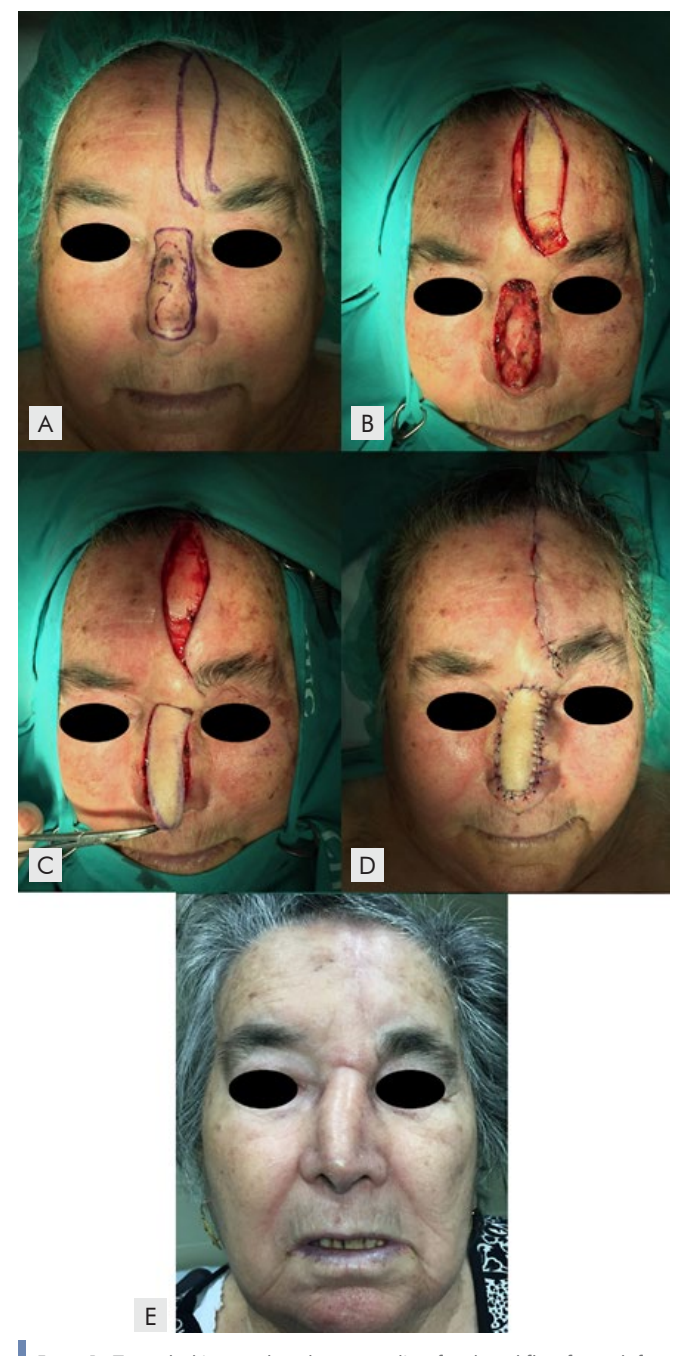
Figure 1 - Tunneled interpolated paramedian forehead flap for a defect affecting the whole dorsum and tip of the nose. (A) planning; (B) flap incision after tumor excision; (C) flap movement under the tunneled under the glabella; (D) flap suture; (E) 2-months post-operative.

The origin of the supratrochlear artery is consistently found to be 1.7 to 2.2 cm lateral to the midline, and the artery exits the orbit by