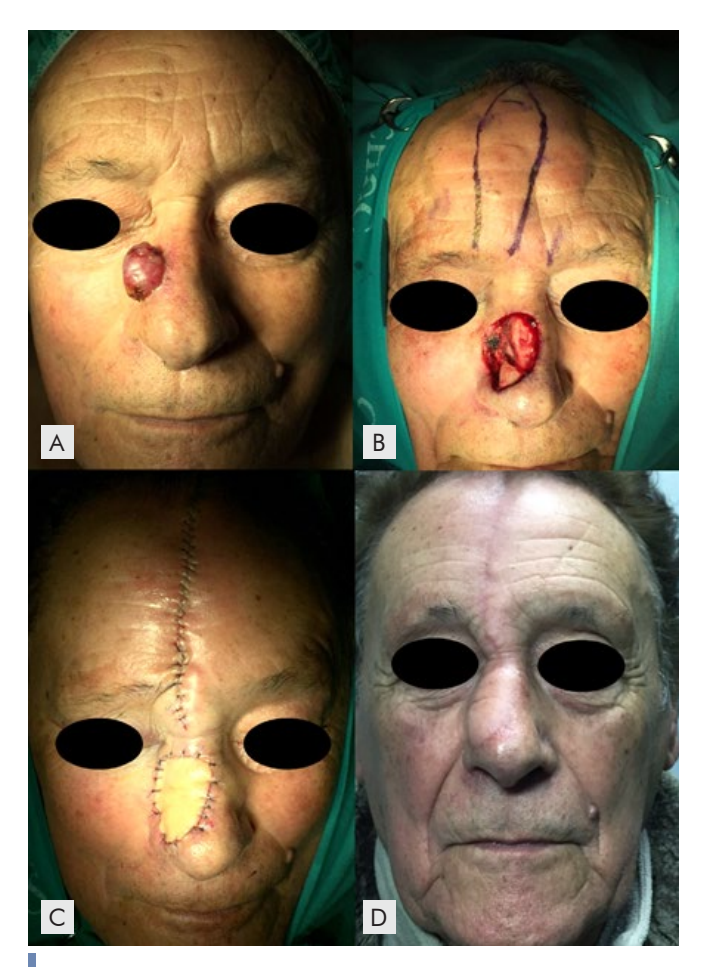
Figure 2 - Tunneled interpolated paramedian forehead flap for a defect affecting the right nasal sidewall and dorsum. (A) primary tumor; (B) tumor excision and flap planning; (C) flap sutured in place; (D) three-months post-operative with significant trapdoor effect.

Fourth, tunneled flaps are also prone to trapdoor effect,<sup>11</sup> particularly when they are relatively bulky with round borders<sup>12</sup> (Fig. 2D). However, a subtle trapdoor effect does not always require a revision, as massaging the scar might be enough to flatten the region. Reducing the flap size in 20% to 25% as compared with the primary defect, suturing in a way as to lower the flap below the surrounding skin and undermining extensively the borders of the receptor area are