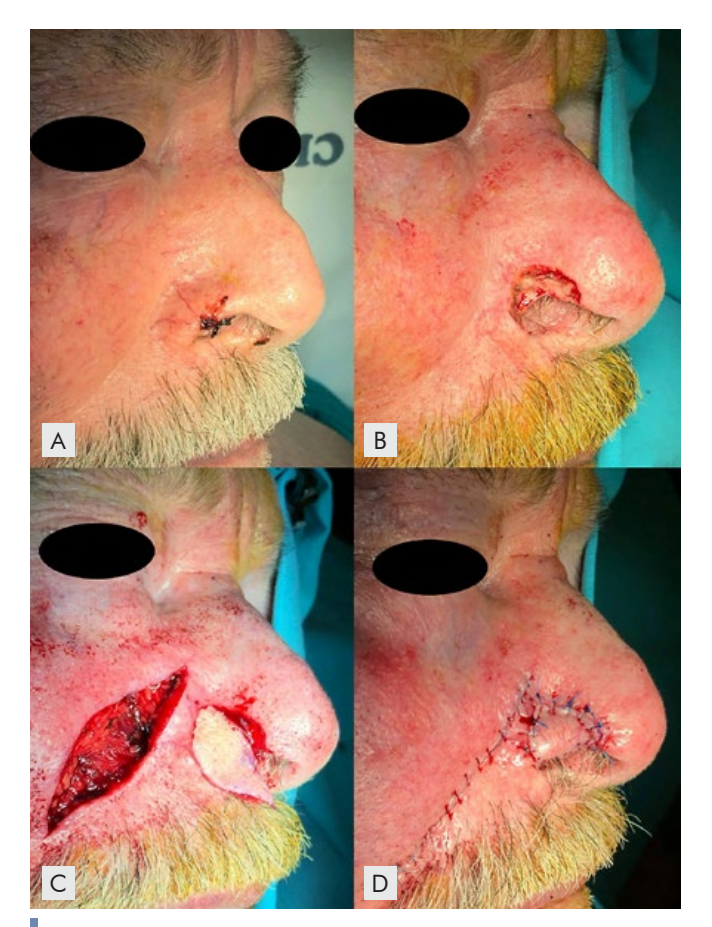
Figure 3 - Tunneled interpolated melolabial flap for a defect of the right nasal ala. (A) primary tumor; (B) tumor excision; (C) flap movement; (D) flap suture.

techniques to help minimizing this problem.<sup>11,12</sup> Intralesional steroid injection can also help to correct this deformity.