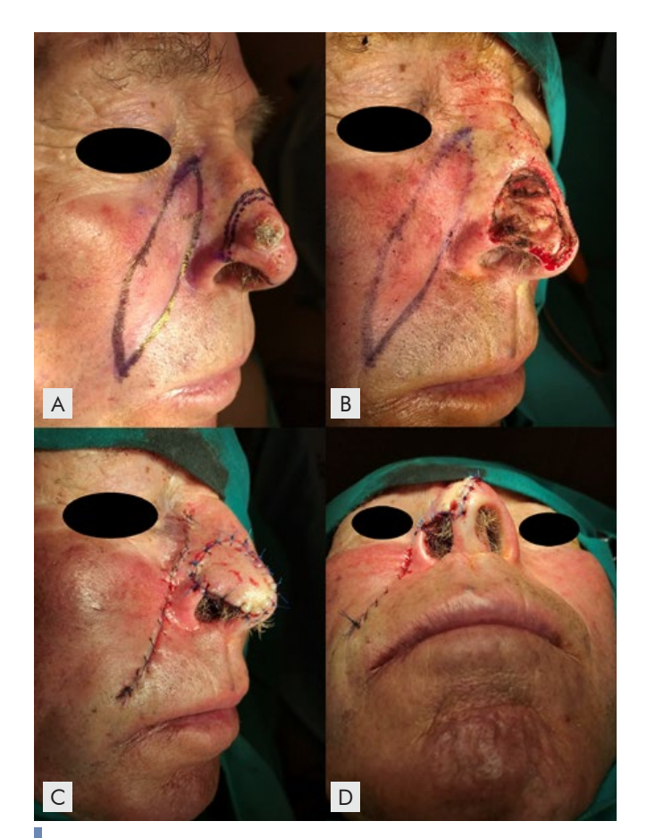
Figure 5 - Tunneled interpolated melolabial flap for a defect of the tip, right sidewall, ala and soft tissue facet. (A) delimited tumor and flap design; (B) tumor excision; (C) flap sutured in place; (D) flap sutured in place (inferior view).

supply and cannot safely be thinned of as much of its subcutaneous fat.<sup>3</sup> The flap is then sutured into the wound without tension, slightly sinking the flap below the surrounding edges.<sup>12</sup> The donor defect is closed up primarily to the base of the pedicle.