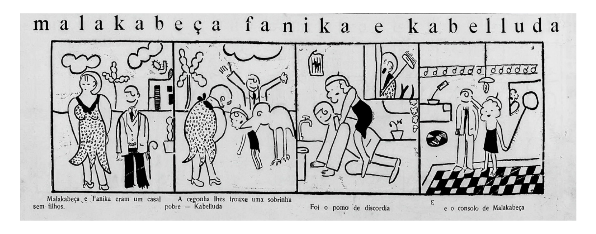
Figure 3. The second strip of the sequence "Malakabeça, Fanika e Kabelluda"

a pamphleteering tone and tells the story of Kabelluda, an unsubmissive young woman. After her newspaper closes, she is taken by a stork to her aunt and uncle, Malakabeça and Fanika, a bourgeois couple. Kabelluda arouses the jealousy of her adoptive mother, as Malakabeça fulfils her niece every wish (Figure 3). She becomes a communist revolutionary and organises a gathering in a public square, where she is ultimately arrested and shot but resurrected on the third day (Figure 4). After being reborn, Kabelluda decides to create a new newspaper. However, Fanika forbids it. Kabelluda flees to Portugal and returns to Brazil with a child whom her moralistic aunt does not accept. Finally, Kabelluda rejects a political boyfriend, runs off with a man of the people, insults a reactionary teacher and ends up lynched (Figure 5).