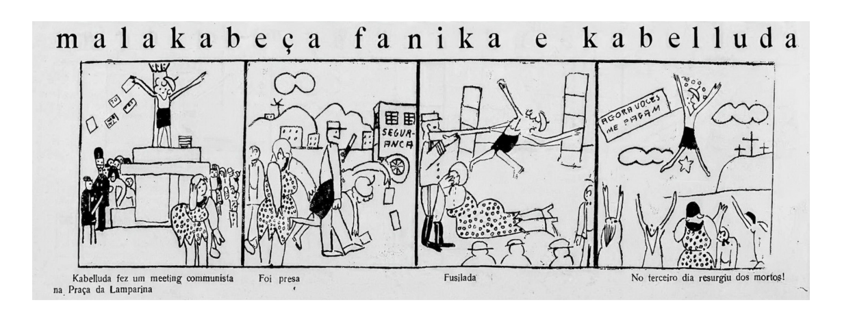
Figure 4. The fourth strip of the sequence "Malakabeça, Fanika e Kabelluda" Source. From "Malakabeça, Fanika e Kabelluda", por Pagu, 1931, O Homem do Povo, 4, p. 6. (https://memoria.bn.br/pdf/720623/per720623_1931_00004.pdf)