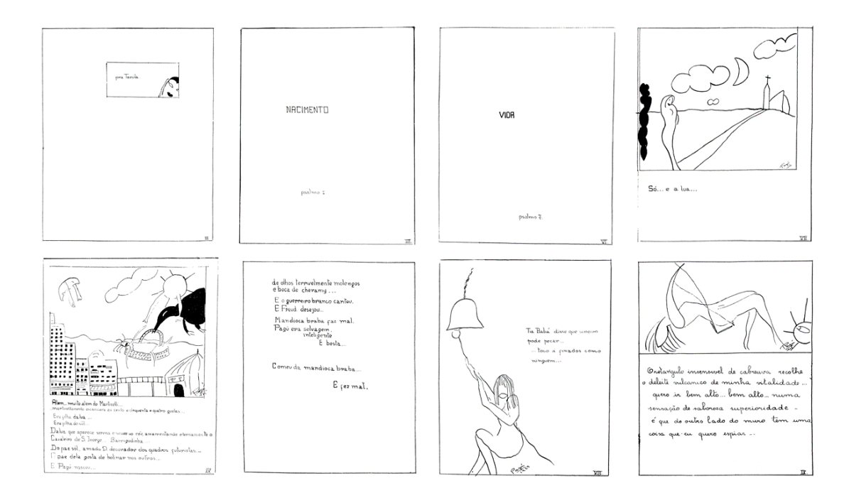
Figure 1. Opening pages of "Nascimento, Vida, Paixão e Morte" (1929) Source. From "Nascimento, Vida, Paixão e Morte", by Pagu, 1975, Código, (2), pp. 25–26 (http://codigorevista.org/revistas/pdf/codigoo2_digital.pdf)<sup>6</sup>

Pagu's album was dedicated to Tarsila do Amaral and remained in her possession for many years until it was discovered by José Luís Garaldi in the library of one of Tarsila's nephews and then published for the first time in the magazine Código , Number 2 (1975), 45 years after its creation. Subsequently it was published in the magazine Através , Number 2 (1978); in the book Pagu: Vida-Obra (Pagu: Life-Work) by Augusto de Campos (1982/2004); and in the compilation Croquis de Pagu e Outros Momentos Felizes que Foram Devorados Reunidos (Pagu's Sketches and Other Happy Moments That Were Devoured Collected), edited by Lúcia Maria Teixeira Furlani (2004).