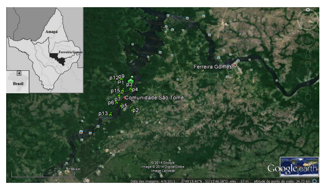
Figure 1 - Location of the visited properties.

The study was carried out in the area where the São Tomé community was located, in the municipality of Ferreira Gomes, Amapá, Brazil, on the left bank of the river Araguari, between coordinates N 00° 49'31 and W 051° 18'33 (Figure 1).