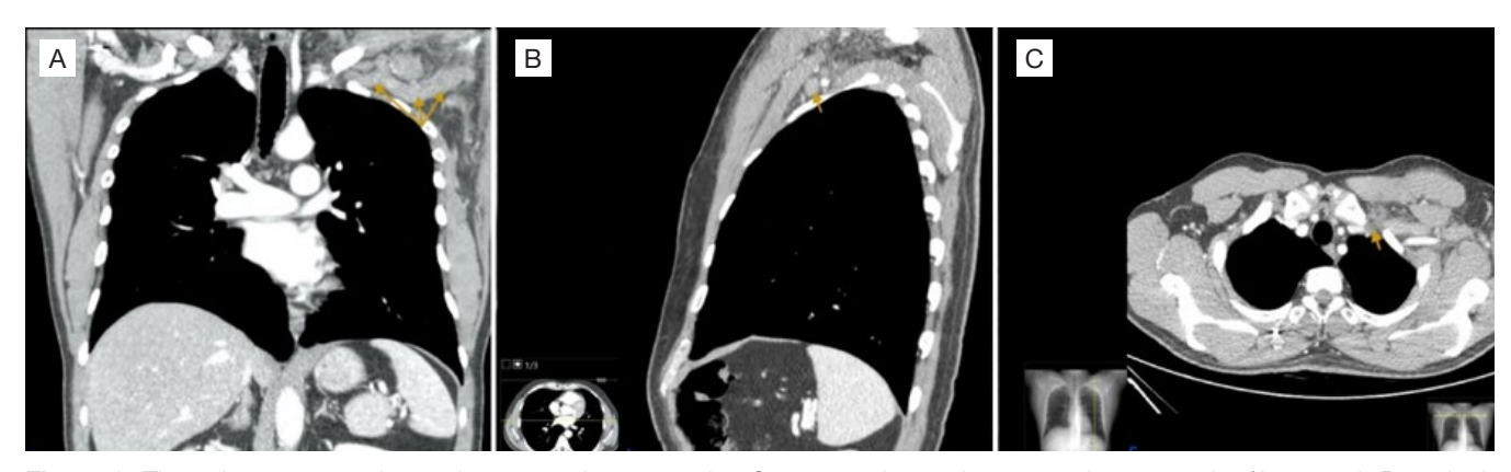
Figure 2: Thoracic contrast-enhanced computed tomography. Contrast-enhanced computed tomography (A-coronal, B-sagittal, C-axial views) demonstrating dilation and decreased opacification of the left subclavian vein and left axillary vein (arrows) compatible with thrombosis.

vein may be restricted by extrinsic compression of the vein by adjacent structures at the thoracic outlet (cervical rib, congenital fiber-muscular bands, hypertrophy of the scalene, subclavian and pectoralis minor muscles, and abnormal insertion of the costoclavicular ligament), contributing to venous injury and consequent thrombosis. It is unclear, however, whether thrombosis results from a single insult or is the result of the cumulative effects of chronic injury.<sup>4-7</sup>