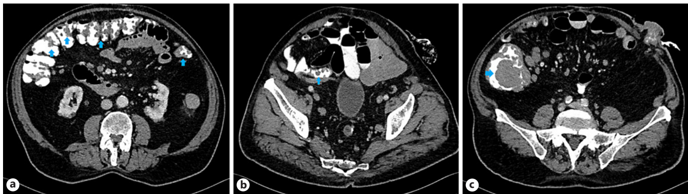
Fig. 1. Computerized tomography scan showing heterogeneous changes in colic mucosa (blue arrows) (a) and in terminal ileum (blue arrows) (b). c Cecal mass (blue arrows).