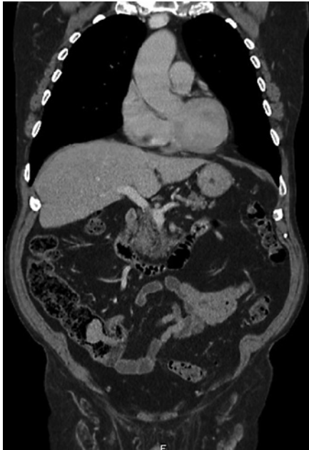
Fig. 1. Thoracoabdominopelvic CT scan (coronal section) with intravenous contrast showing a voluminous endoluminal polyp at the caecum measuring 40 × 31 mm with homogeneous enhancing. No alterations at surgical anastomosis level.