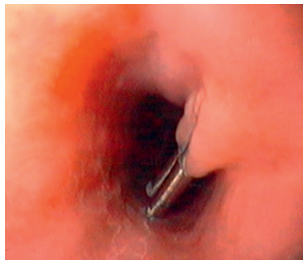
Figure 4 Upper GI endoscopy performed on day eleven showing successful fistula closure with two clips.

Esophageal involvement in tuberculosis is rare 1,2 in both immunocompetent and immunocompromised hosts 2 and is almost always associated with mediastinal lymphadenopathy. The esophagus is the organ least likely to be infected by tuberculosis. 1