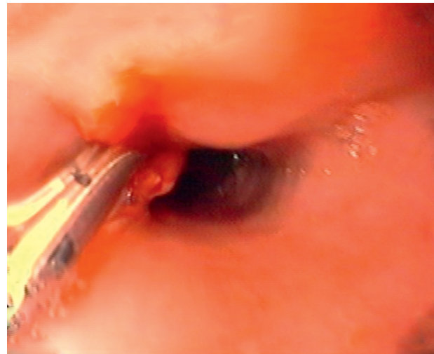
Figure 3 Upper GI endoscopy revealing fistula closure with endoscopic clips.

The decision was made to place endoscopic clips (Resolution Clips Boston Scientific®) for fistula orifice closure (Fig. 3). Four days later an upper endoscopy was repeated and another clip placed on the largest esophageal ulcer to promote fistula closure. On the eleventh day, endoscopic and radiologic closure of the fistula was confirmed (Fig. 4). The patient remained asymptomatic and resumed oral nutrition after closure confirmation. Two months later, there was no evidence of esophagomediastinal fistula, with one clip remaining. After six months, there were only discrete signs of healing.