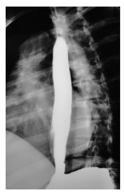
Figure 2 Barium esophagography was unremarkable.

During the next 6 months, her symptoms improved. An endoscopy was then carried out and new biopsies from middle and distal esophagus were taken. No eosinophils were found in the biopsy specimen.