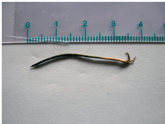
Figure 3 A silk suture line of 3.5 cm in length.

by convergent folds, a small ulcer with a visible vessel was found with great difficulty due to lack of distensibility of this area. Endoscopic hemostasis with adrenaline was done and was apparently effective.