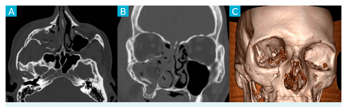
FIGURE 2. ZMC fracture with displacement resulting from elbow impact during a soccer game. A- axial view; B- coronal view; C- 3D reconstruction.