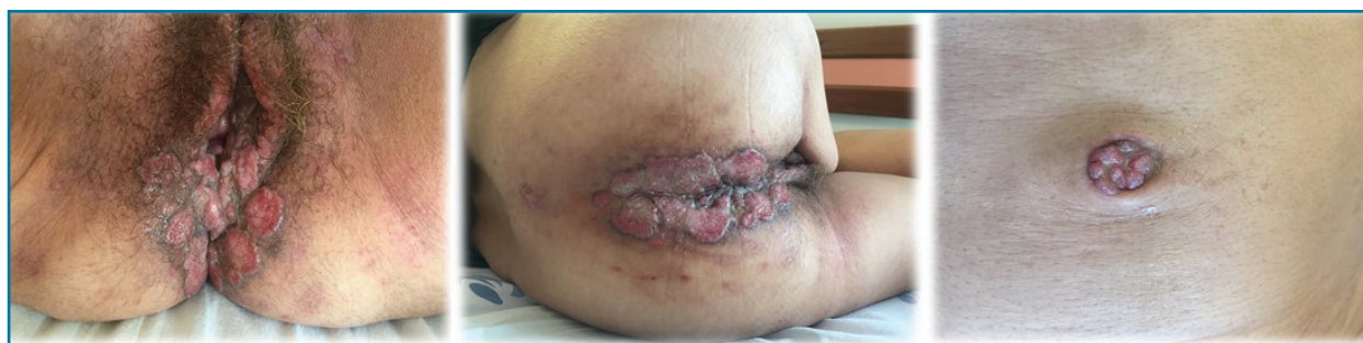
FIGURE 1. Vulvar, perianal, between the buttocks and umbilical lesions